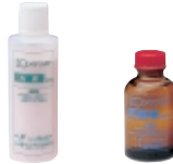
META FAST Powder Liquid