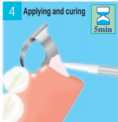
4 Applying and curing