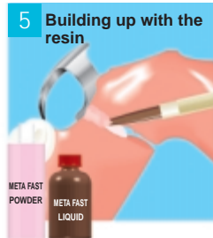
5 Building up with the resin