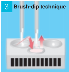
3 Brush-dip technique