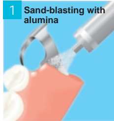
1 Sand-blasting with alumina