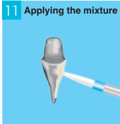
11 Applying the mixture